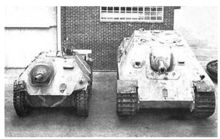
Hetzer & Jagdpanzer 38(t)